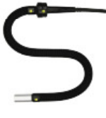
Blow assembly + connector