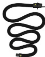
Super stretch hose assy complete