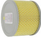
Exit filter (placed after motor)