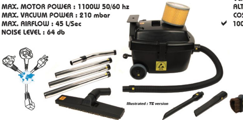
Illustrated : TE version

MAX. MOTOR POWER : 1100W 50/60 hz MAX. VACUUM POWER : 210 mbar MAX. AIRFLOW : 45 L/Sec NOISE LEVEL : 64 db