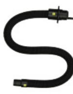
Original hose assy complete