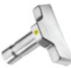
Large aluminium upholstery nozzle