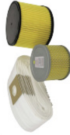
1 x MT-851 + MT-853 + MT-858