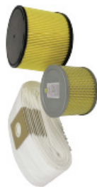
1 x MT-851 + MT-853 + MT-857