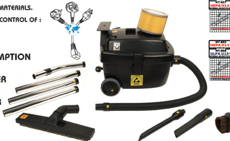
Illustrated : TE version

MEASUREMENTS : 39 x 34 x 42,5 CM (LxWxH). WEIGHT : 6 KG (APPLIANCE)