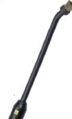
PHU-05 ESD c/w brush head