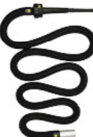
Blow assembly + connector (long version)