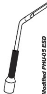
Modified PHU-05 ESD c/w mini crevice nozzle