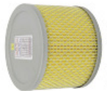
Exit filter (placed after motor)